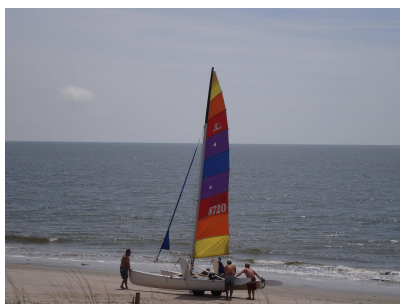
Another beautiful day for sailing on Edisto