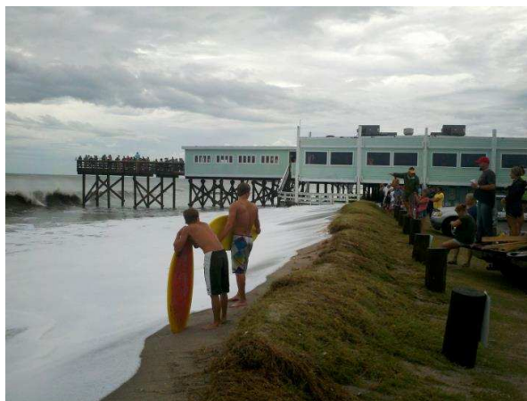
Hurricane Irene does little damage

Family Membership DUES ..... $ 30.00 Donation to Lobbyist Fund ..... $ _____ Total Amount Enclosed ..... $ _____